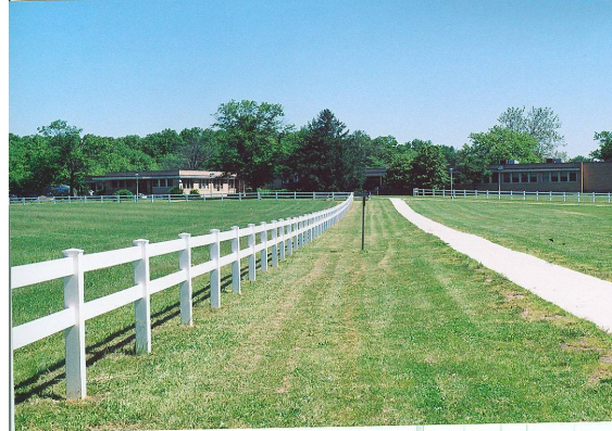
Pathway to Maple Hall

APH's healthcare is organized according to four primary service divisions: Admissions/Acute Care, Extended Care, Geriatric-Psychiatric Care, and Forensic Care. Each building has one to four treatment units for a total of 14 operational patient care treatment units across the entire hospital. Services are provided to address a variety of client needs including the client's legal status, level of functioning, level of care needs, and anticipated length of hospital stay. Additional special units meet the needs of patients who test positive, may have been exposed to COVID 19 or need to quarantine following admission.